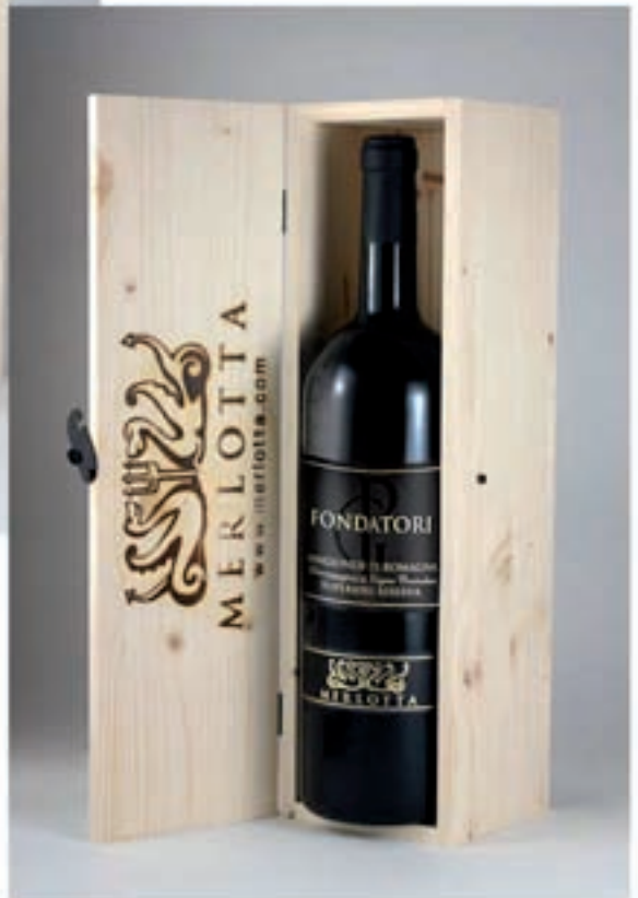
“FONDATORI” SANGIOVESE DOC ROMAGNA SUPERIORE RISERVA