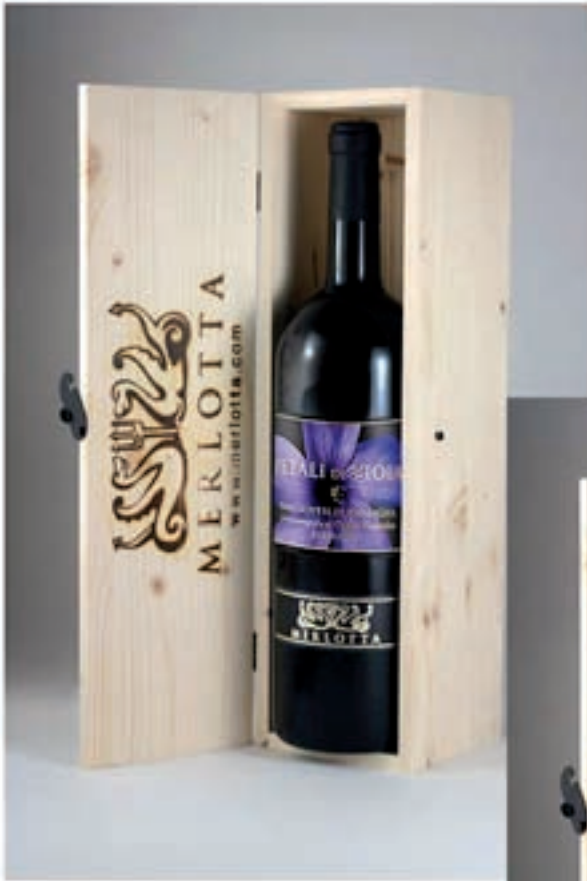
“PETALI DI VIOLA” SANGIOVESE DOC ROMAGNA SUPERIORE